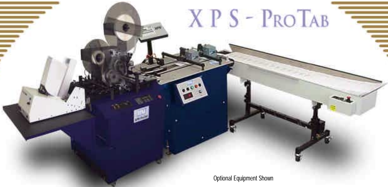
Optional Equipment Shown